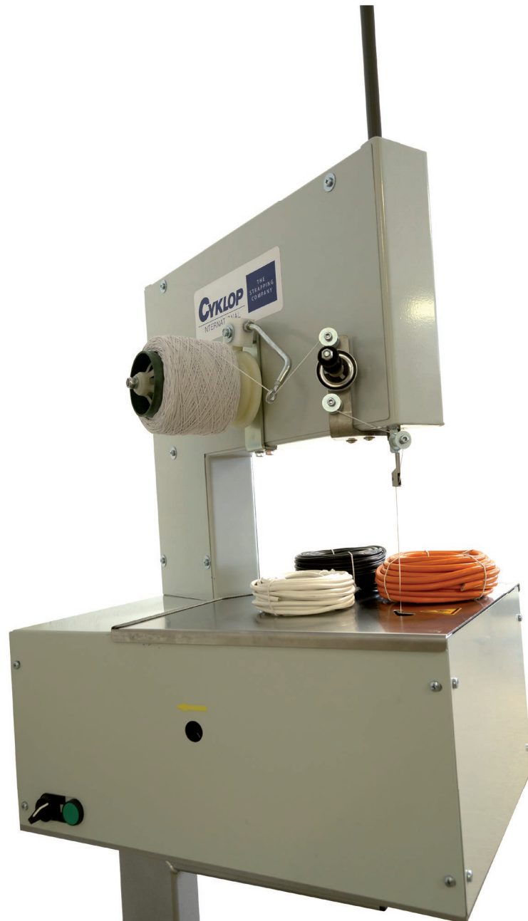
ELASTIC CORD TYER MODEL: AXRO IN2