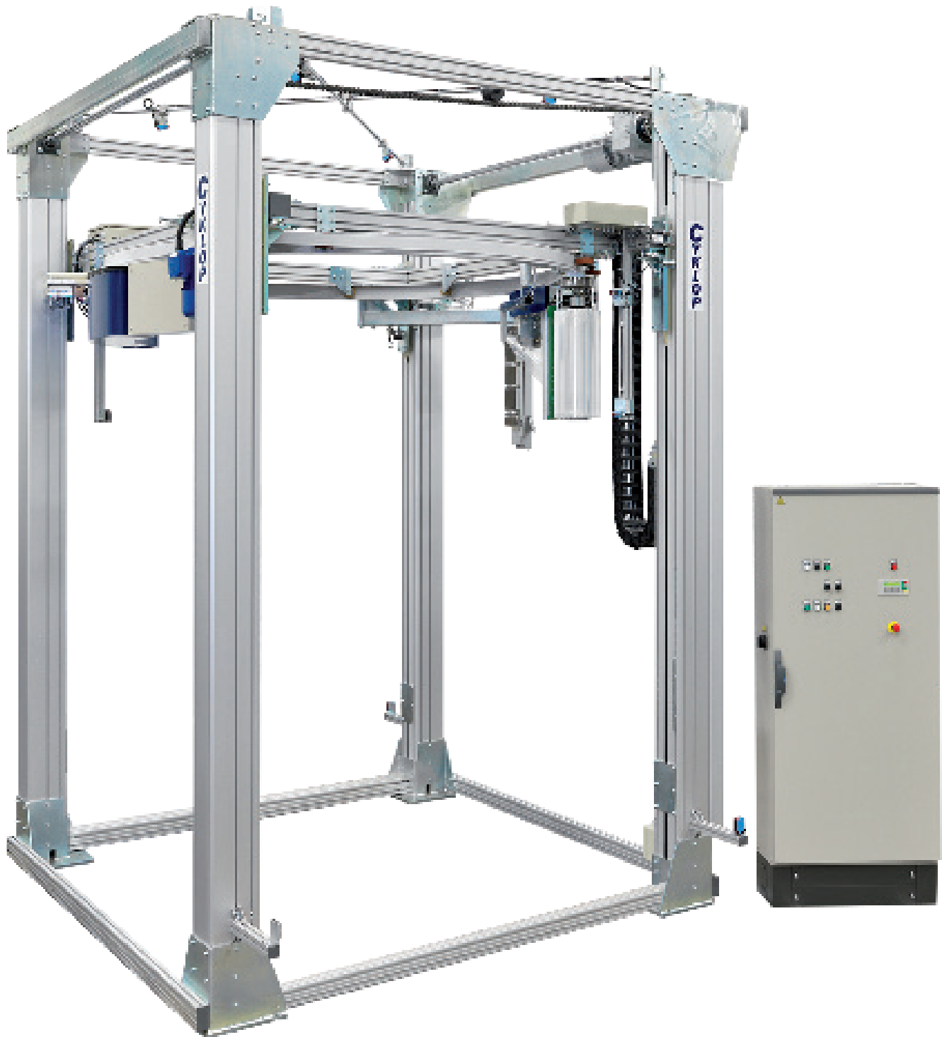
STRETCH WRAPPER MODEL: GL 2000