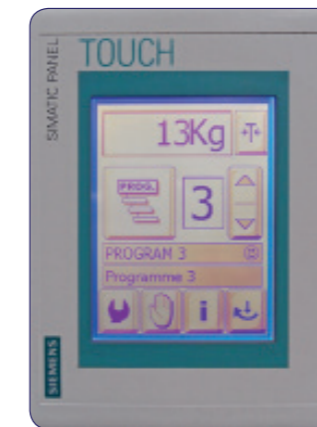
Touch screen Siemens.